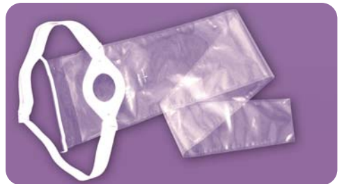
Irrigation belt flange and sleeve

The water container should be clear, enabling the water level to be seen, and should preferably have a liquid crystal temperature indicator. The flow control should be easy to operate with one hand. The irrigation flange should give a secure seal around the stoma and the disposable sleeve should be long enough to hang into the toilet. It can be trimmed if needed. Once used, the flange and cone should be washed with antibacterial soapy water, dried and stored until their next use. There is normally no need to wash the reservoir.