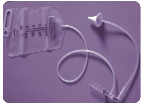
Water reservoir, tubing, flow control and cone